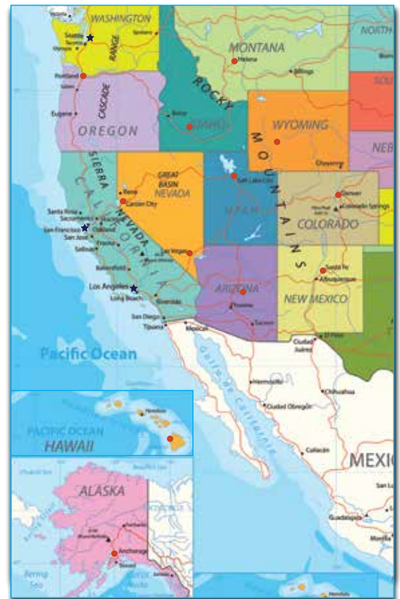
★ Office Locations ● Sales Territories